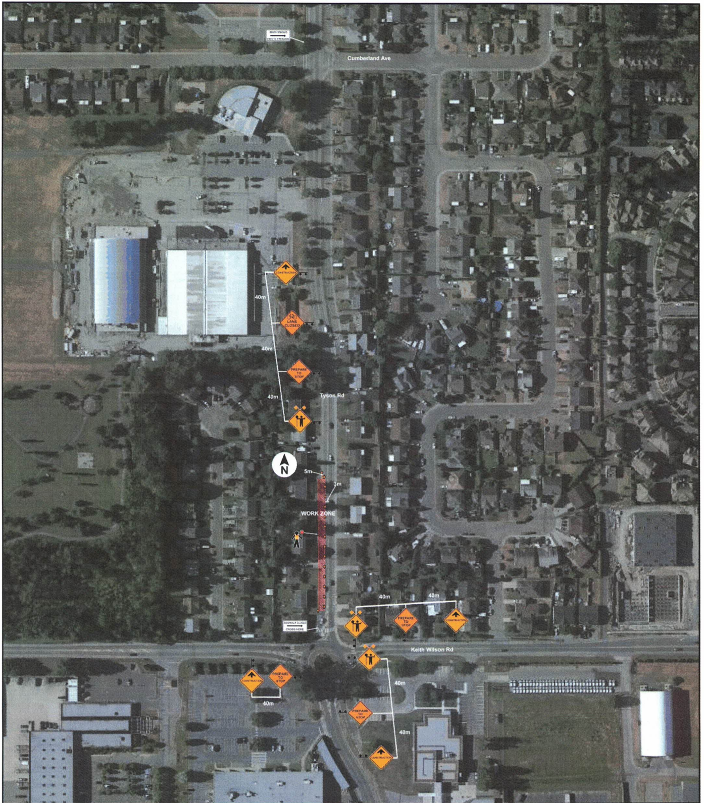
Figure 7.7: Roadside Work - Encroachment into Travel Lane - Short Duration TCP on site to assist with vehicles, pedestrians, bicyclists and all others